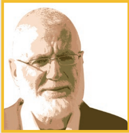
MP Mohamad Abu Tayr

In the following paragraphs, we will put in your hands a small introduction about the deputies who got arrested in 2019.